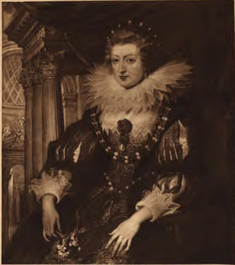
Elisabeth of France. Queen of Spain